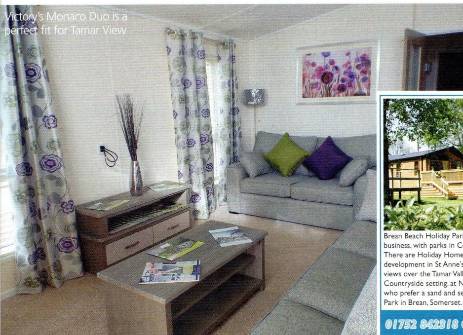
Victory's Monaco Duo is a perfect fit for Tamar View

For further information or to arrange a viewing, please contact: Tamar View Holiday Park and Notter Bridge Park, Saltash, Cornwall PL12 4RW T: 01752 842318 E: info@notterbridge.co.uk W: www.breanbeachholidayparks.co.uk