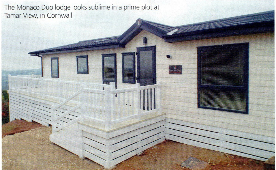
The Monaco Duo lodge looks sublime in a prime plot at Tamar View, in Cornwall

for them by visiting the website. All homes have front patio doors opening onto a 16ft x 8 sun deck, parking space and choice of pitch. Plus, it's an 11-month season, offering great access for owners.